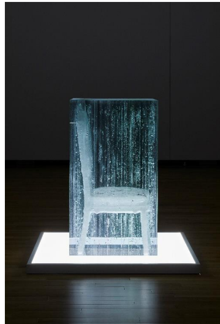
Miyanaga Aiko, waiting for awakening - chair- , 2017. Installation view from "Miyanaga Aiko: Rowing Style" (Takamatsu City Museum, 2019.)

* The exhibition title Absolute Chairs was inspired by Absolute Beginners, a song by David Bowie. The exhibition plan developed from questions that rose from the idea of the “absolute”, such as “what is the source of the definitive charm of a chair?”, or “what is the ultimate chair in art?”