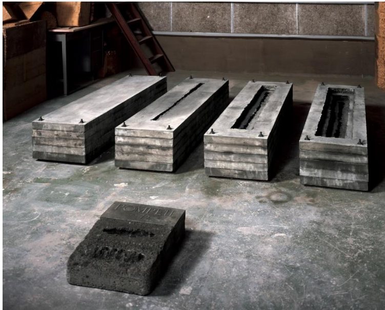
POMPEII・79 Part1, 1974/1987 © Shigeo Toya