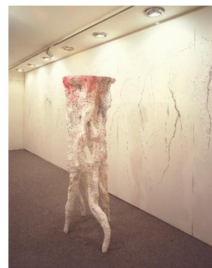
Going Underground II, 1984