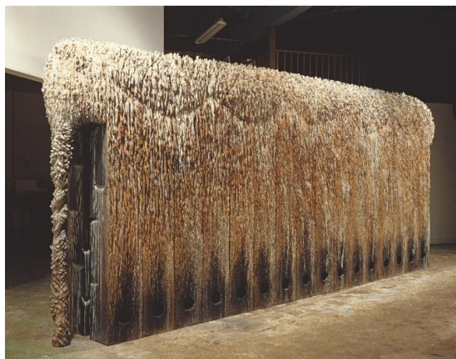
Death of the Kiln of the Elephant of the Woods, 1989 The collection of Museum of Contemporary Art Tokyo