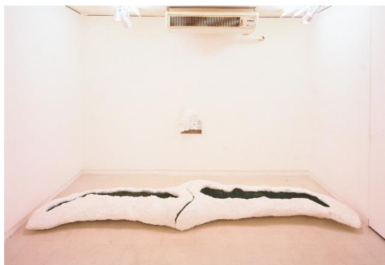
Underground Room, 1984, photo: Yamamoto Tadasu