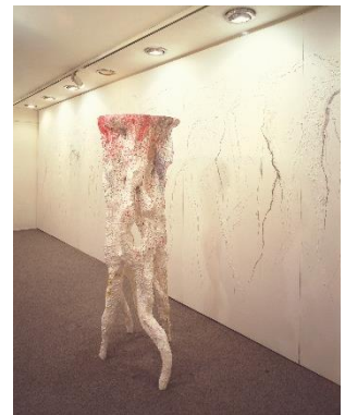
Going Underground II, 1984