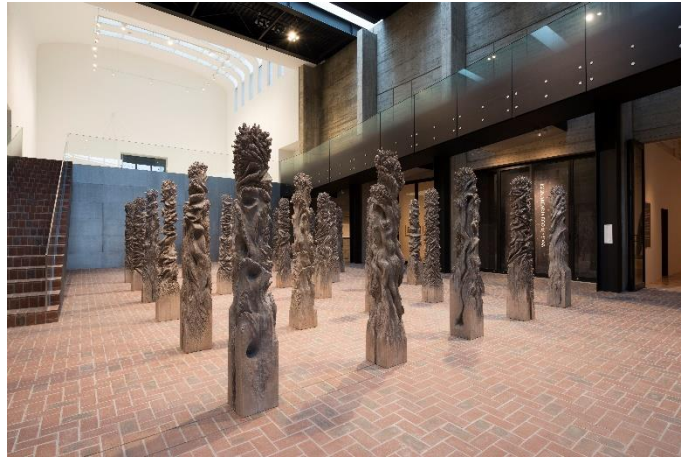
Woods IX, 2008 from the collection of the Musee Bernard Buffet

In addition to the reproduction of POMPEII・・・79 Part 1, presented at his first solo exhibition in 1974, other representative series such as Woods, Minimal Baroque, and Body of the Gaze will be introduced together. Approximately 40 pieces will be on display, ranging from sculptures made as a student to his latest series.