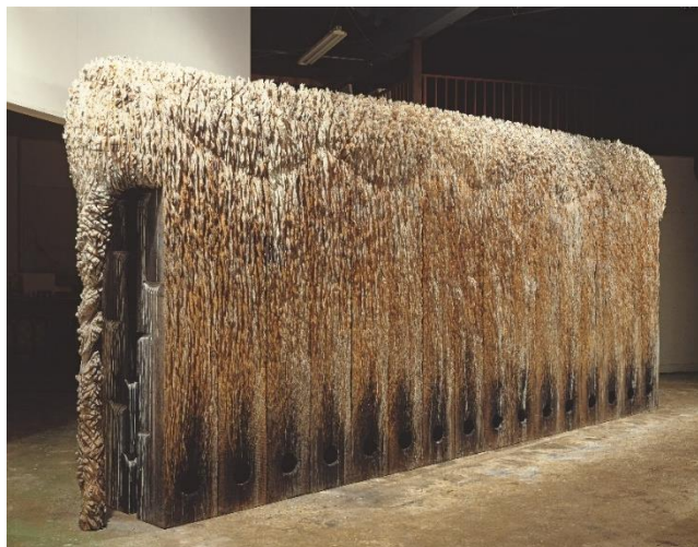
Death of the Kiln of the Elephant of the Woods, 1989 from the collection of Museum of Contemporary Art Tokyo photo: Yamamoto Tadasu © Shigeo Toya, Courtesy of ShugoArts

Toya Shigeo established his studio in Chichibu District, Saitama Prefecture in 1998, and his work has been based in this prefecture since. This exhibition, will be his first solo exhibition at a prefectural public art museum in about 20 years, will be jointly held by the artist's home prefecture of Nagano and a prefectural art museum of Saitama Prefecture, his base of creative production.